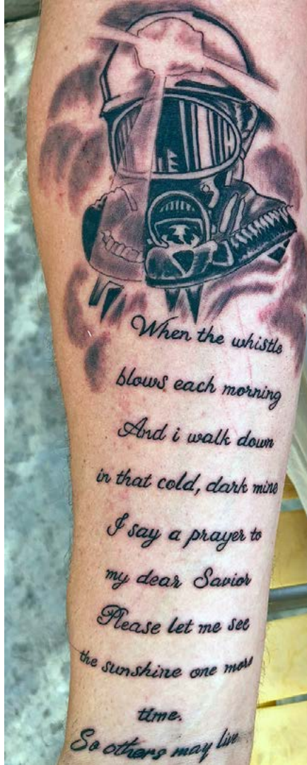
COLTON RIDGWAY Waste Isolation Pilot Plant, New Mexico