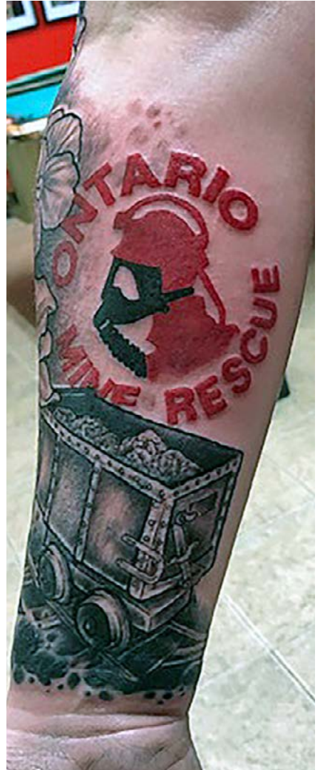
KRISTY GUENETTE Kirkland Lake Gold, Holt Complex