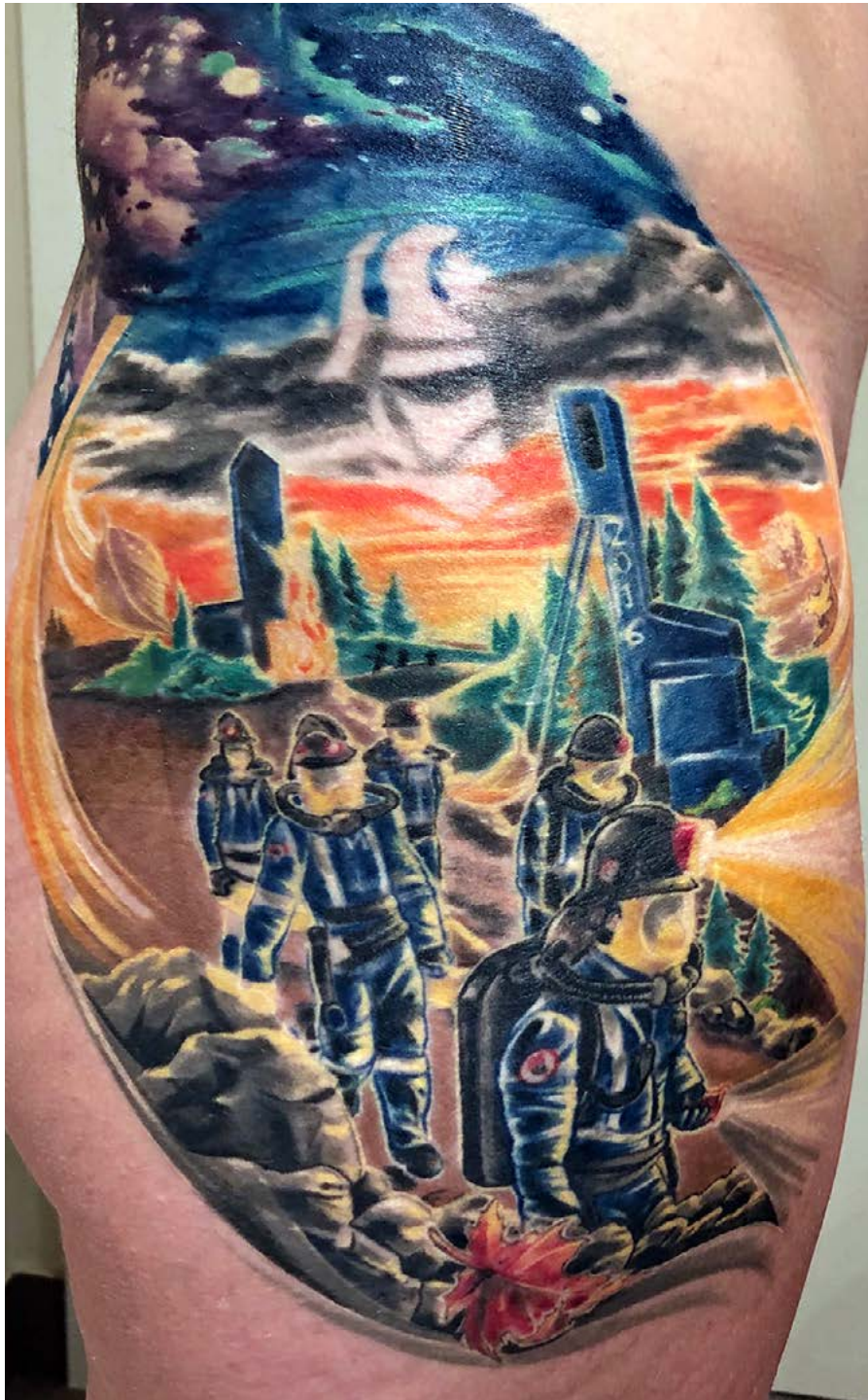
LYNNE BOUCHARD, Kirkland Lake Gold, Fosterville Mine, Australia