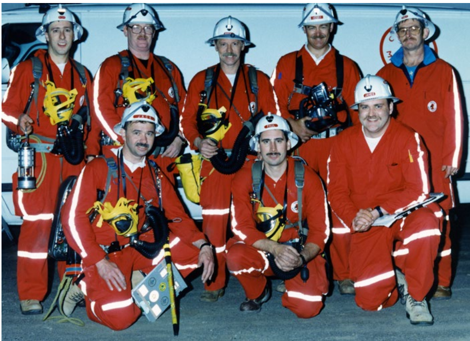
STUMPED AGAIN? - Oops! Apparently there are no familiar faces in Stanleigh Mine's 1993 mine rescue team which represented Elliot Lake/Algoma in the Ontario Mine Rescue Provincial Competition. If you can identify any member, please email kensitter@workplacesafetynorth.ca .