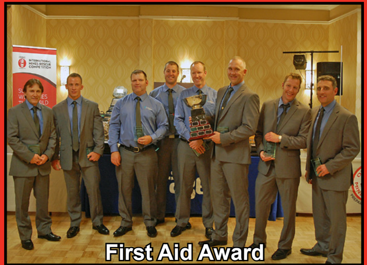
First Aid Award