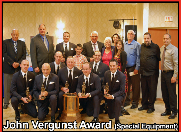
John Vergunst Award (Special Equipment) Sudbury INO, A Glencore Company