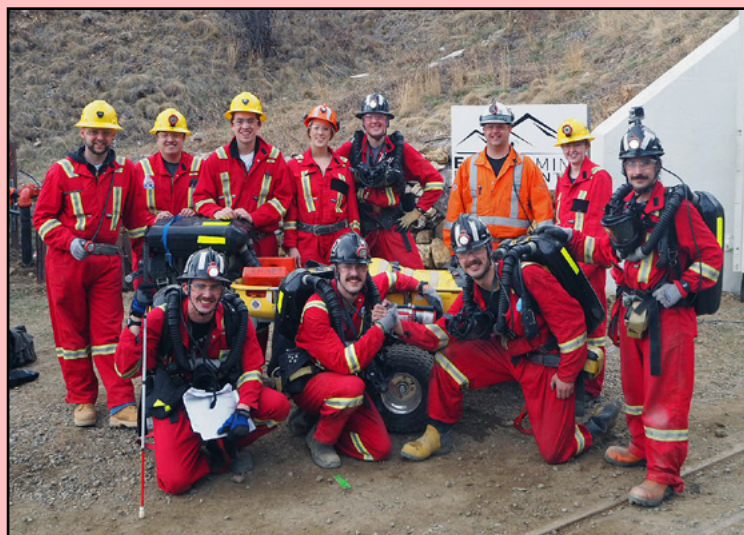
TOP TWO – Left, Laurentian University mine rescuers review site maps during the 2017 Intercollegiate Mines Emergency Response Development competition in Golden, Colorado. Right, the University of British Columbia's mine rescue team gathers for a picture following the underground event. Laurentian and UBC finished first and second, respectively, during the competition.