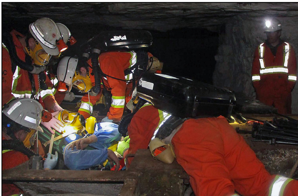
NOT A DRILL – Above, CGC Hagersville mine rescuers attend to a casualty during a recent training session. Below, CGC Hagersville’s competition mine rescue team following the 2016 Southern District Competition.

“He had a lot of praise for the team that responded to him. He said he was packaged up in under 10 minutes, loaded on our personnel carrier, and headed to surface very quickly.”