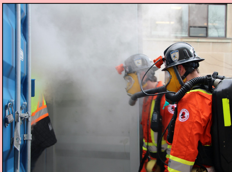
STUDENT GAMING – Left, a Laurentian University student uses a computer simulation to assess his knowledge of underground firefighting during the 2017 Canadian Mining Games in Toronto. Right, Laurentian University students prepare to enter a smoke-filled trailer to find their way through a confined space maze.