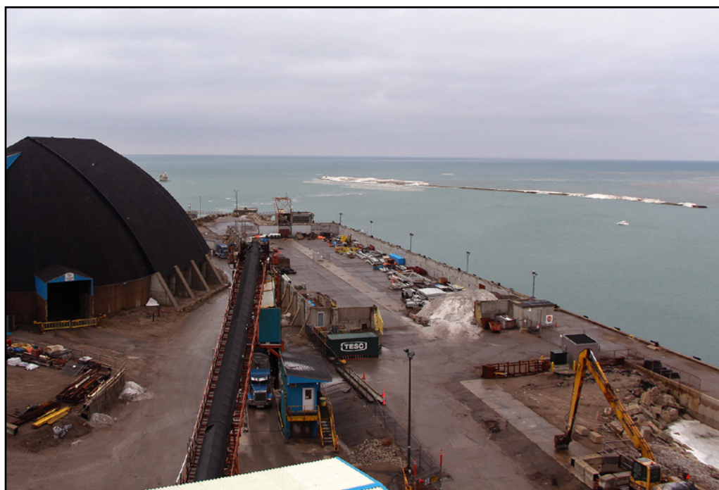
RIGHT THERE – The site of the 2017 Provincial Mine Rescue Competition will be approximately 1,750 feet under Lake Huron, in Compass Minerals Goderich Mine.