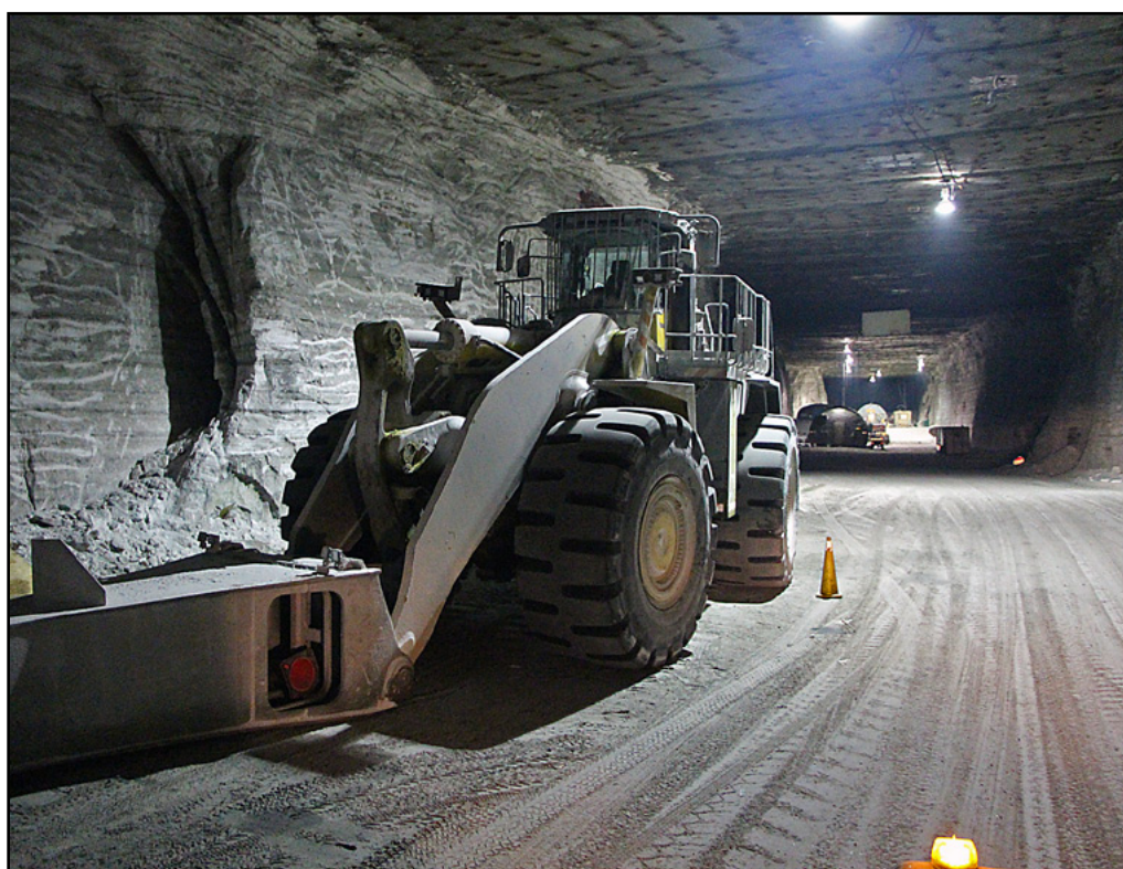
SAFE TO CROSS – A drift in Compass Minerals Goderich Mine is more than wide enough for two-way heavy equipment traffic.