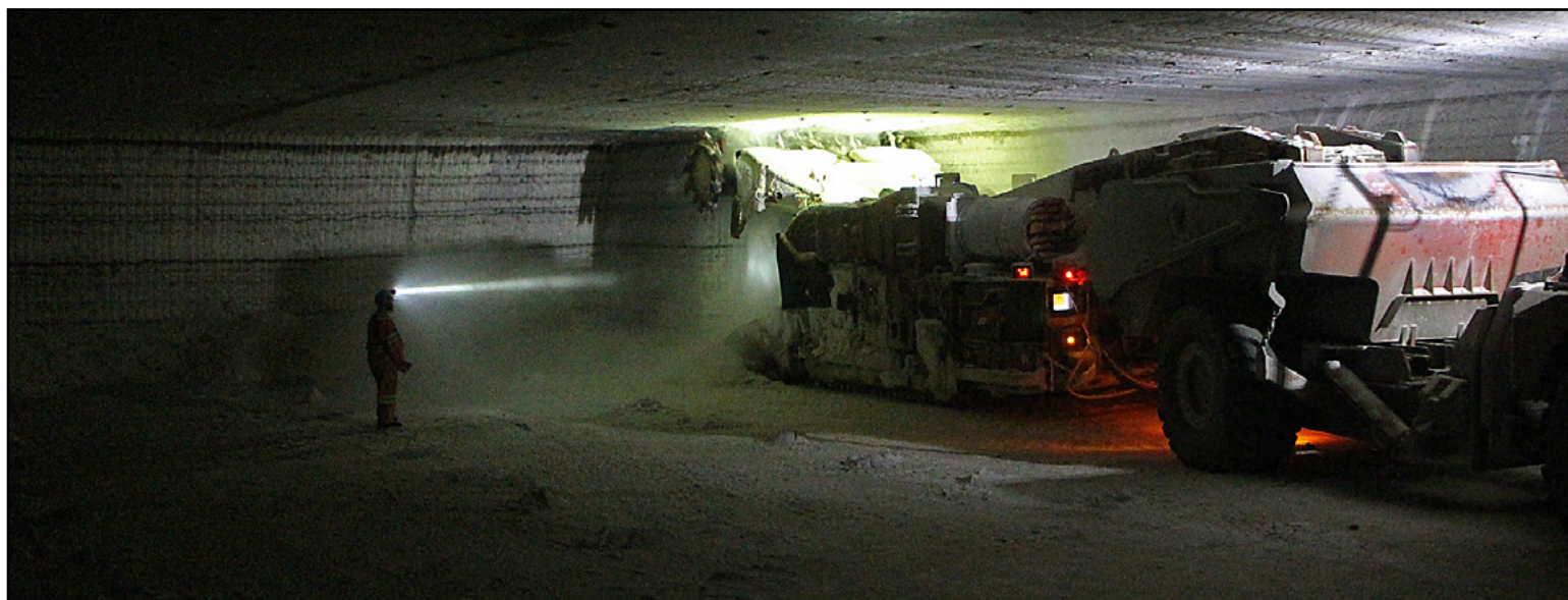
NOT SO BIG? – A miner watches a continuous mining machine sweep at the face of Compass Minerals Goderich Mine. As machines cut multiple levels, the back or roof can grow to about 20 metres.