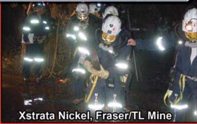
Xstrata Nickel, Fraser/TL Mine