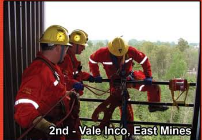
2nd - Vale Inco, East Mines