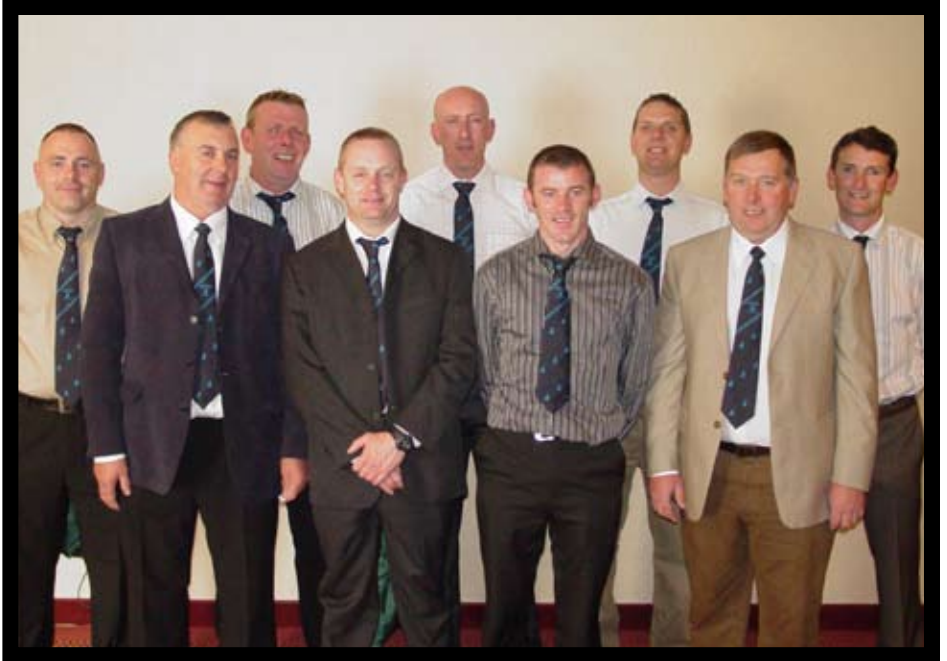
Mine rescuers from Boliden Tara Mines in Ireland, special guests at this year's Provincial Mine Rescue Competition, extended an invitation to Ontario mine rescuers to drop in for a visit next year.