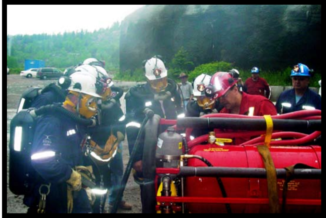
Xstrata Nickel mine rescuers, winners of the Firefighting Award at the Provincial Mine Rescue Competition, receive instructions on how to use the RRU 30 foam generator.

A worker wearing fall arrest had fallen off a five-storey building and was hanging by his safety lanyard about 15 metres above ground. Teams had to conduct a pickoff rescue using GripTech Rope Rescue equipment, lowering a team member down the side of the building to recover the victim, and then lowering both to the ground.