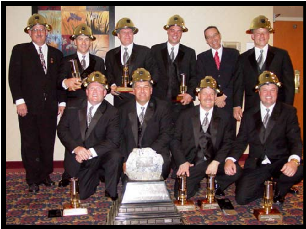
Mine rescuers from Xstrata Nickel, Fraser/TL Mine struck gold at the Provincial Mine Rescue Competition in Sudbury, winning three of the four team categories including the Overall Competition Award.

Mine rescuers from Xstrata Nickel Fraser/TL Mine mined deep at the 58th Ontario Provincial Mine Rescue Competition in Sudbury in June to win three of four team categories, including the coveted gold helmets as the Overall Competition winners.