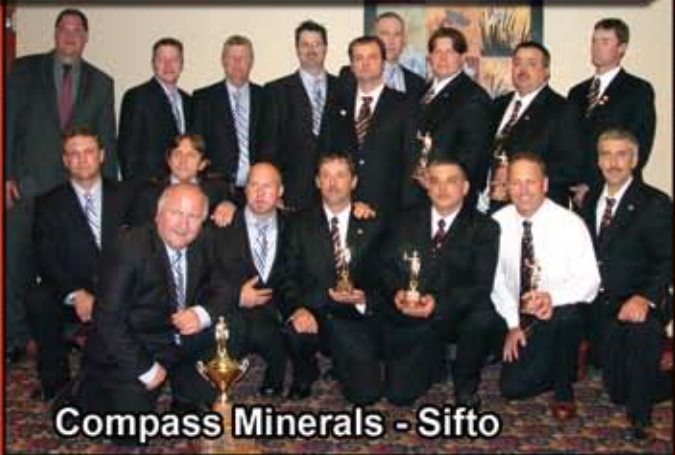
Compass Minerals - Sifto