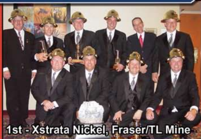
1st - Xstrata Nickel, Fraser/TL Mine