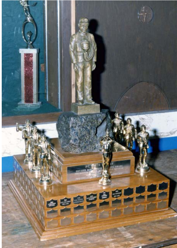
The original P.C. Smith Trophy