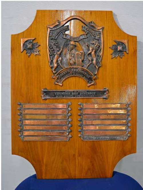
The Joseph Errington Award