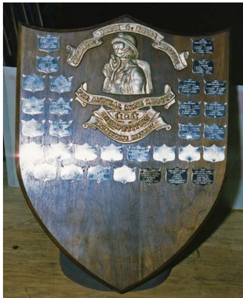
The original Percy Smith Award