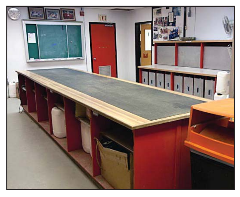
Easy access to vehicles and the mine, an adjacent office for the briefing officer, and a full stock of supplies also help to make a mine rescue substation emergency ready.