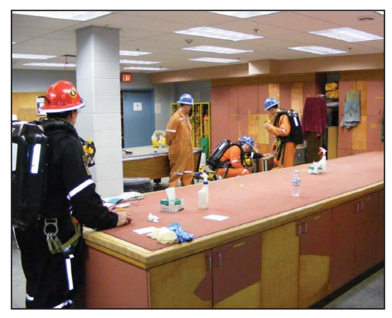
Dome's spacious mine rescue substation gives mine rescuers plenty of extra space for cupboards, tabletop work areas, men and even a seldom-used pool table that is used mainly as another work surface.