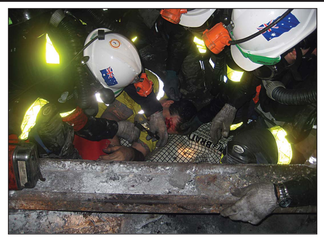
Australian mine rescuers compete at the seventh International Mine Rescue Competition last year in Wollongong, Australia.