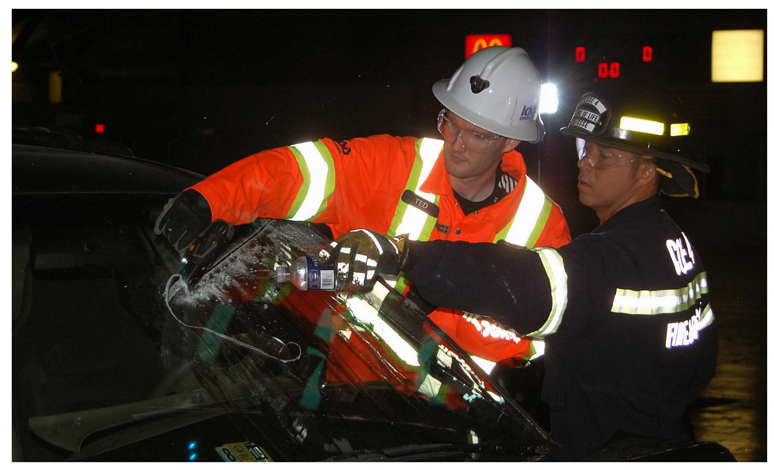
During this year's competition mine rescue teams had a non-competitive lesson in special rescue equipment.