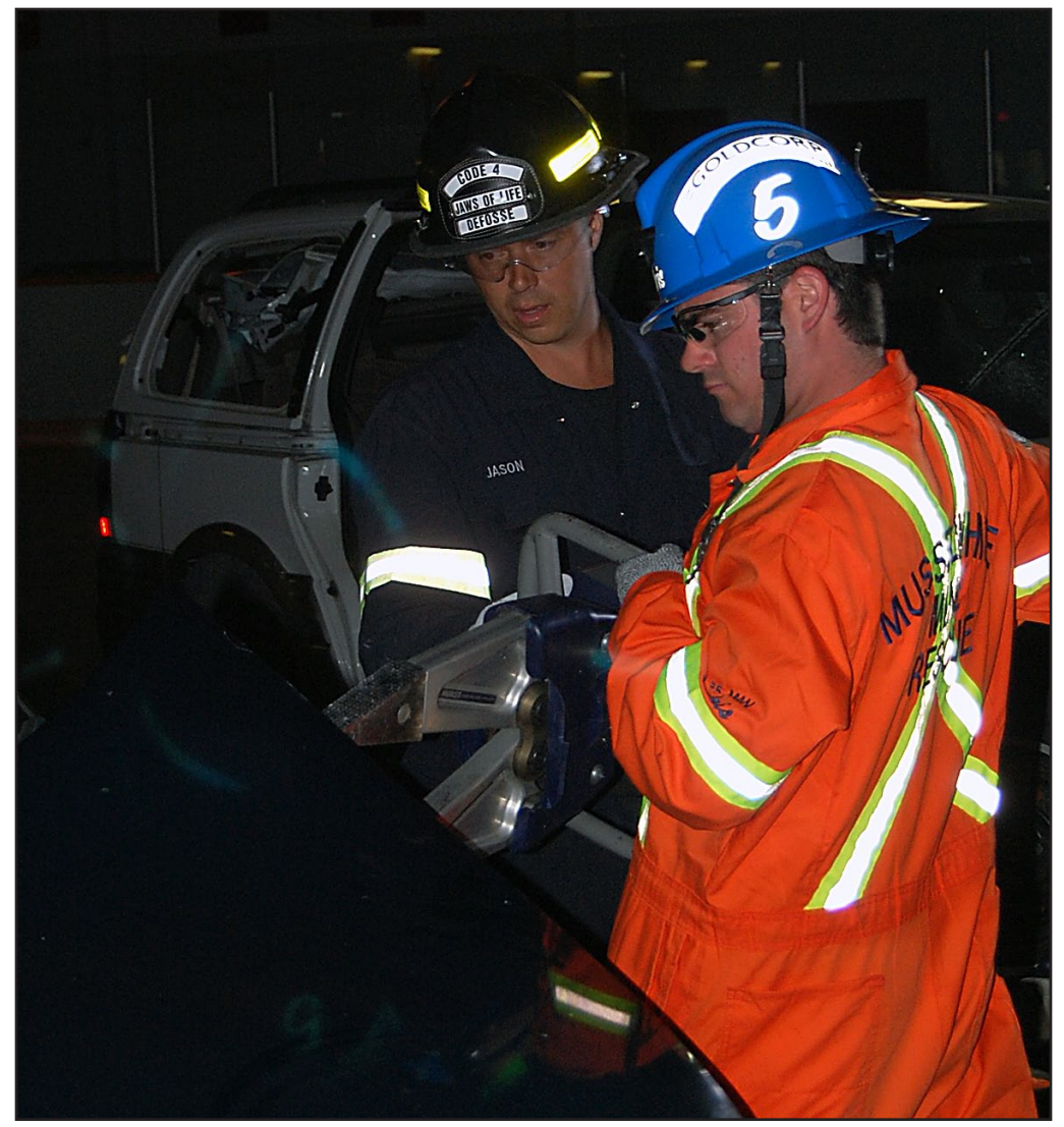
Open wide! A trainer guides a mine rescue volunteer using a Hurst eDraulic Spreader during a demonstration exercise at the 2013 Provincial Mine Rescue Competition.