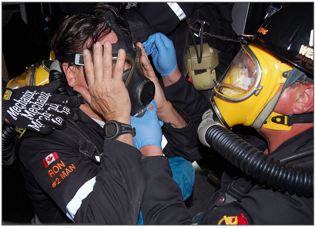
Knowing that mine rescuers voluntarily enter hazardous environments doesn't lessen the responsibility to look after their health and safety, says an Australian mine rescue official.