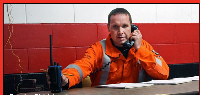
Onaping District Glencore Sudbury Integrated Nickel Operations

Red Lake District Goldcorp Canada, Musselwhite Mine