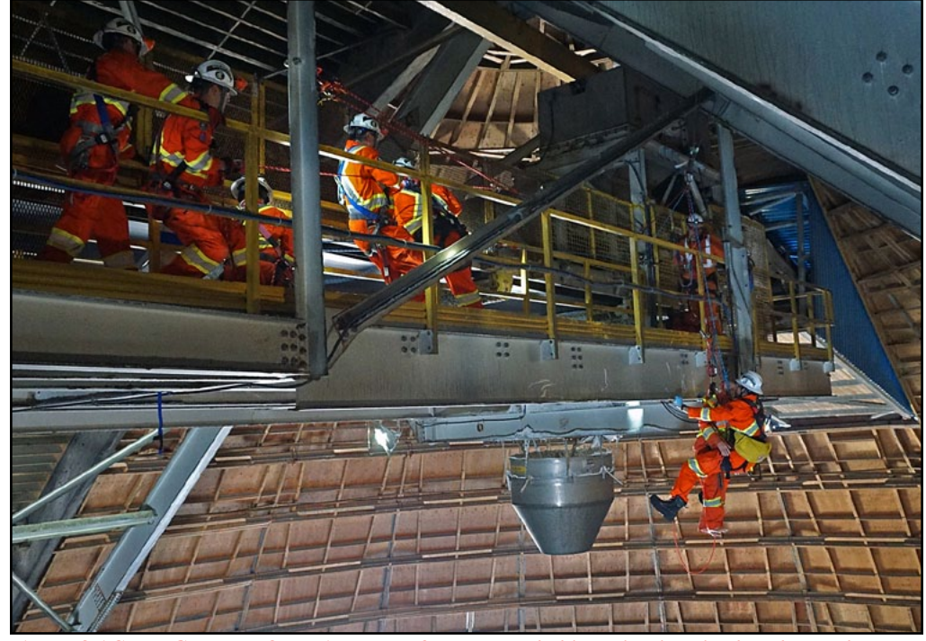
APPROACHING THE TOP – A rescuer from Musselwhite Mine is raised to the top by team members using Ontario Mine Rescue's new rope rescue system during the 2017 Provincial Mine Rescue Competition.