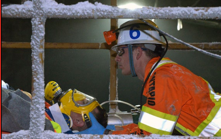
North American Palladium, Lac des Iles I