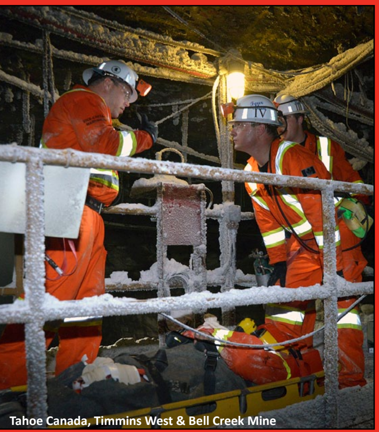
For the 2017 Provincial Competition Album, visit bit.ly/2vuWXsh or see our website www.workplacesafetynorth.ca/minerescue