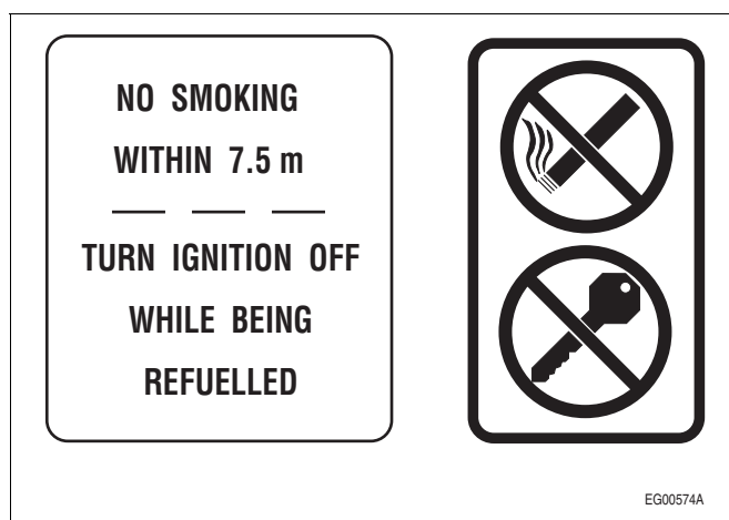
Figure A-4.6.8.8.(2) Fuel-dispensing station signs

A-4.7.4. When used in this Subsection, the terms “loading” and “unloading” shall mean the loading and unloading of tank vehicles or tank cars.