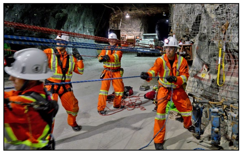
Mine rescuers for Tahoe Canada, Timmins West and Bell Creek Mines want to replicate their 2018 Ontario Mine Rescue Provincial Competition achievement at the 2018 International Mines Rescue Competition this September in Ekatrinburg, Russia.