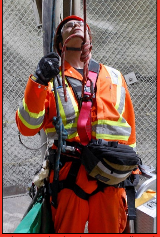
Tahoe Canada, Timmins West & Bell Creek