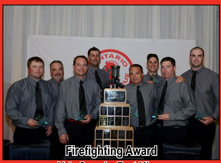
Vale Canada, East Mines