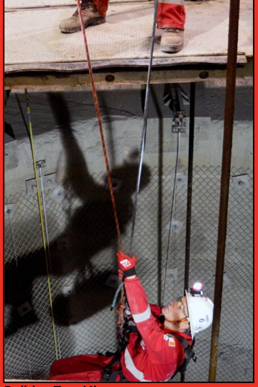
Boliden Tara Mine