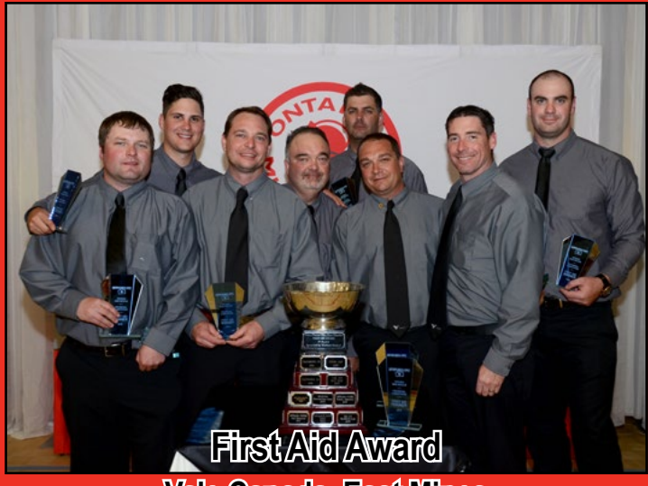
Vale Canada, East Mines