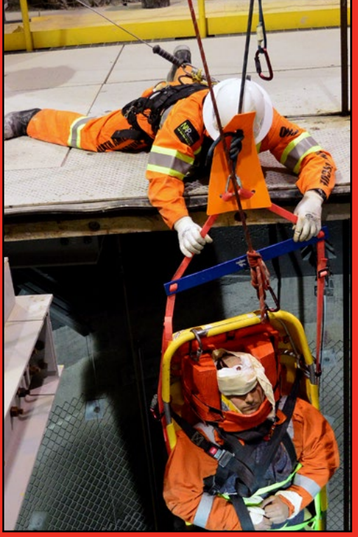
North American Palladium, Lac des lles