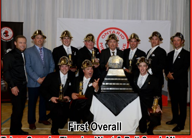
Tahoe Canada, Timmins West & Bell Creek Mines