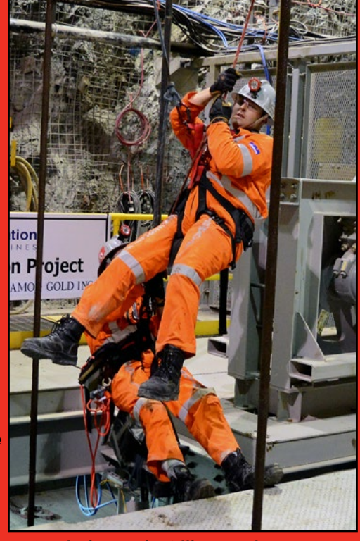
K+S Windsor Salt, Ojibway Mine

Note photos can be downloaded for personal, non-commercial use from our albums.