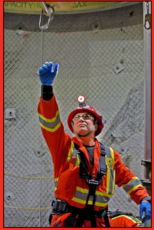
Vale Canada, East Mines