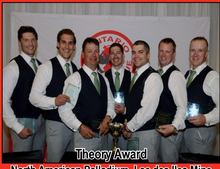
North American Palladium, Lac des lles Mine