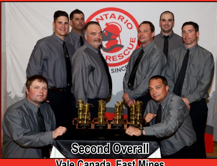
Vale Canada, East Mines