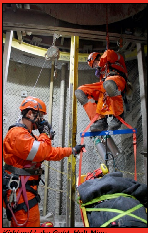
Kirkland Lake Gold, Holt Mine