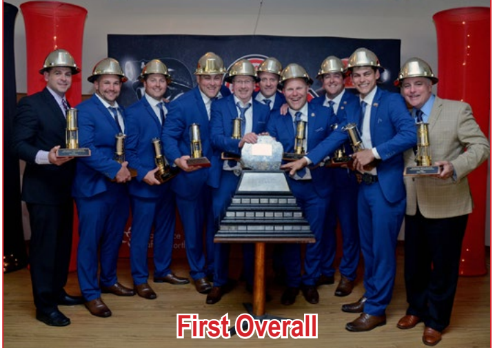
K+S Windsor Salt, Ojibway Mine