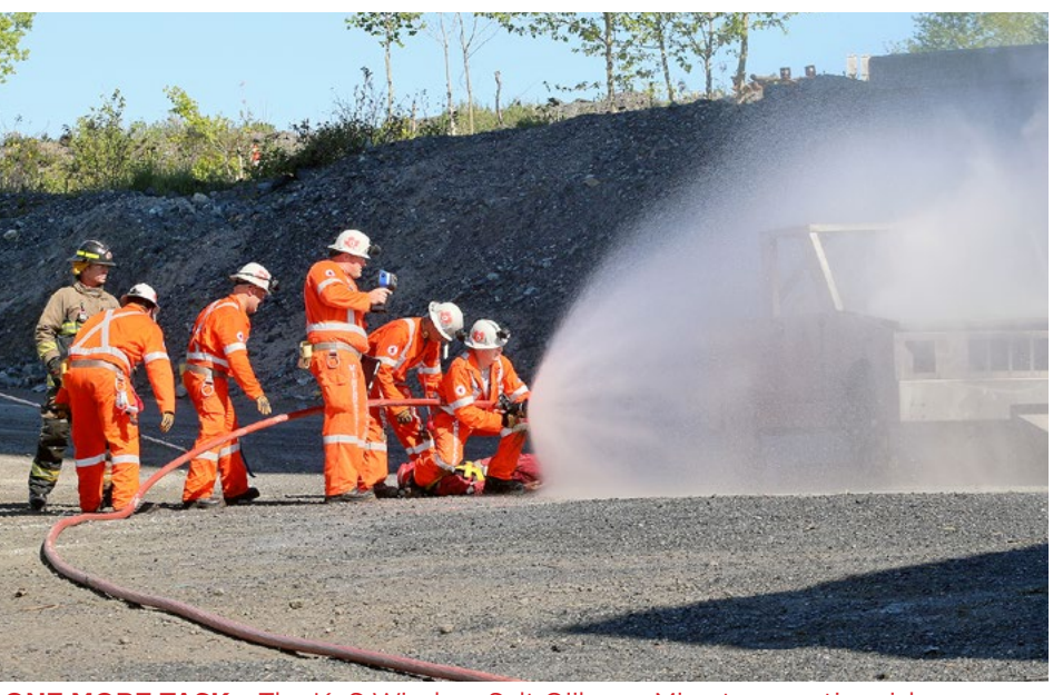
ONE MORE TASK – The K+S Windsor Salt Ojibway Mine team extinguishes a vehicle fire and completes the final task of the 2019 Ontario Mine Rescue Provincial Competition.

"Each worker should have individualized fitness goals identified and provided to them so that they are tailoring the fitness program," she said.