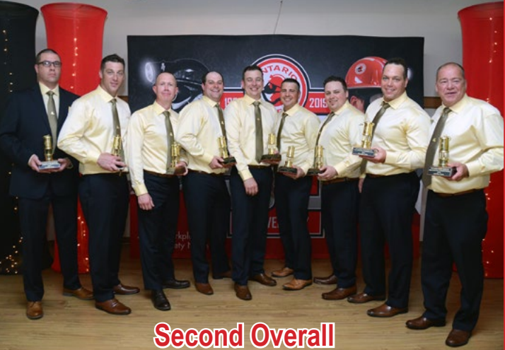
Newmont Goldcorp, PGM