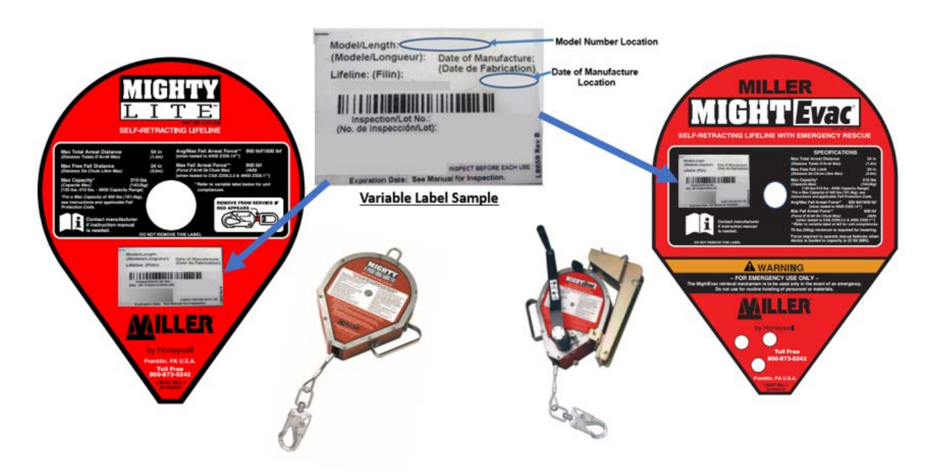
Figure 1: Variable Label

• Each unit contains a Variable Label located on the front or back of the unit. The specific Model and Date of Manufacturer is printed on the Variable Label.