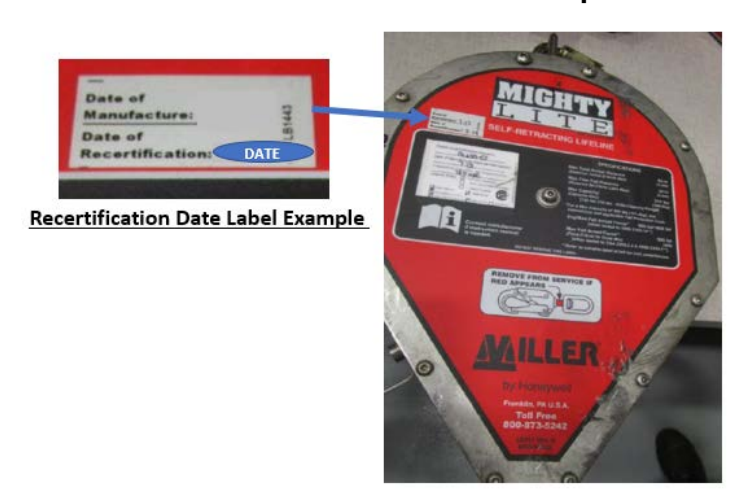
Figure 2: Recertification Label Example

• Each unit contains a Variable Label located on the front or back of the unit. The specific Model and Date of Manufacturer is printed on the Variable Label.